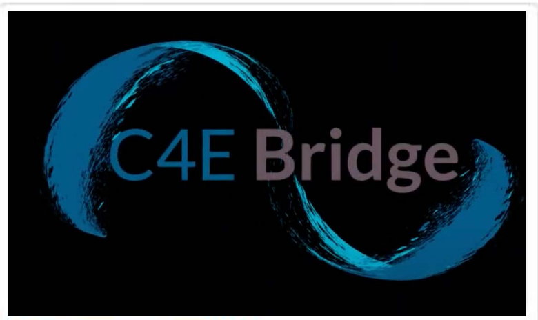
C4EBridge Promo 🔔