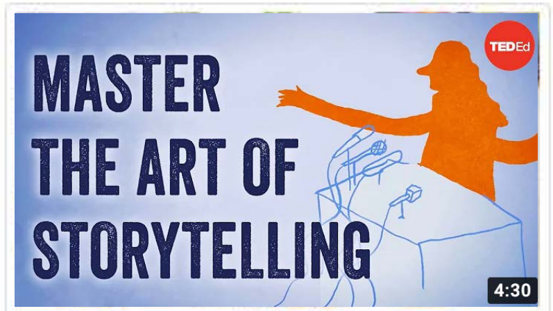
How to Do a Presentation (or Panel Interview)