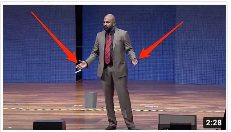
How to start a presentation 🔔